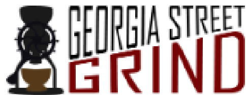
Georgia Street Grind in Indianapolis, Indiana