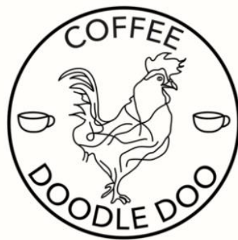
Coffee Doodle Doo in Portland Oregon