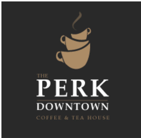
The Perk Downtown Coffee & Tea House in Colorado Springs, CO