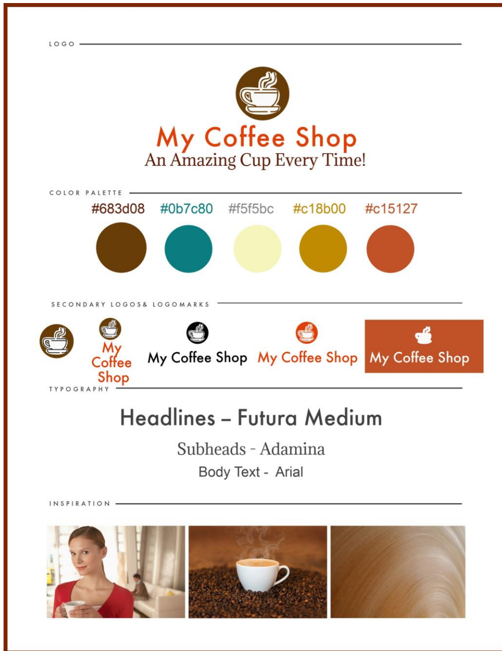
Example of a Brand Guide for a Coffee Shop created using PicMonkey