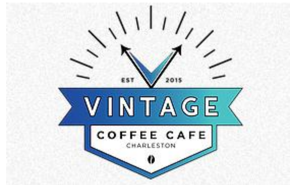
Vintage Coffee Cafe in Charleston, SC