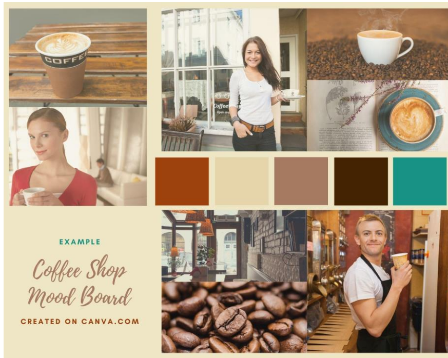
Example of coffee shop mood board created using Canva